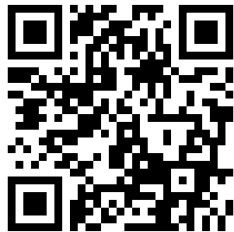
Our Savior's UMC