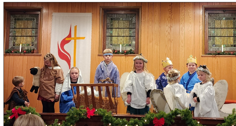
Montana Salem UMC