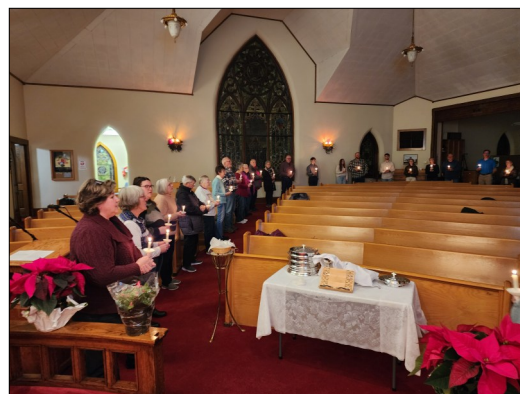
Our Savior's UMC