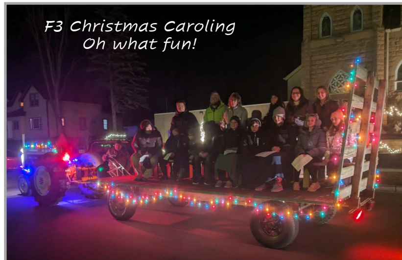
F3 Christmas Caroling Oh what fun!