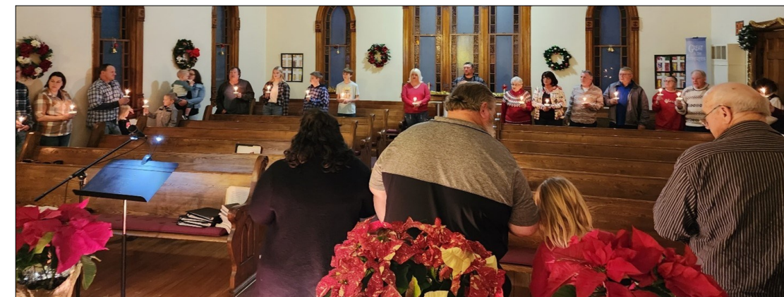
2024 Christmas Eve Service at Gilmanton UMC