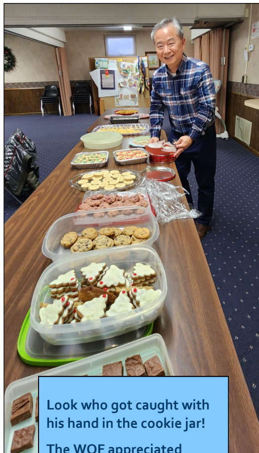
Look who got caught with his hand in the cookie jar! The WOF appreciated Pastor's help filling cookie tins for our shut-ins.