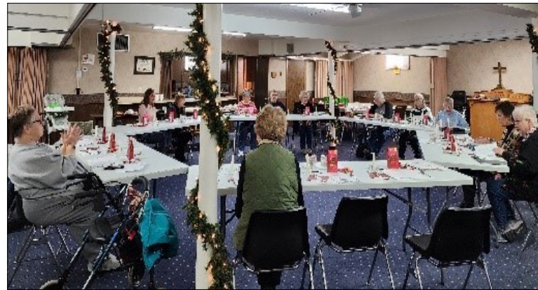
UMW Candlelight Service