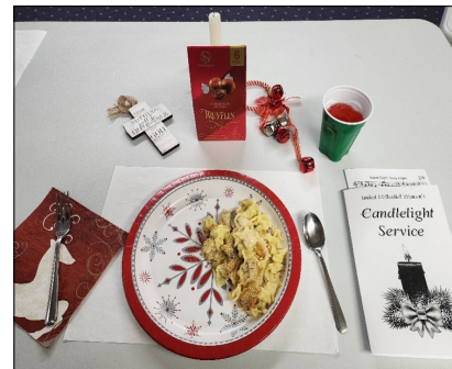
UMW Candlelight Service

dozen rosettes were made. Additionally, 125 packs of lefse and 80 quarts and 46 pints of pickles. It was noted that people appeared to have an enjoyable time and many newcomers were there. Discussion took place regarding changing the hours to 9 a.m. to 3 p.m. next year.