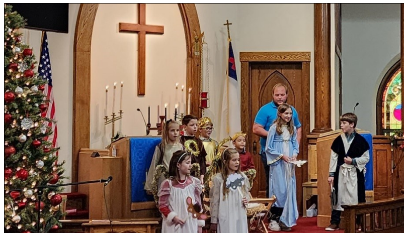
Children's Christmas Program