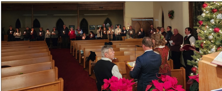
2024 Christmas Eve Service at Our Savior's UMC